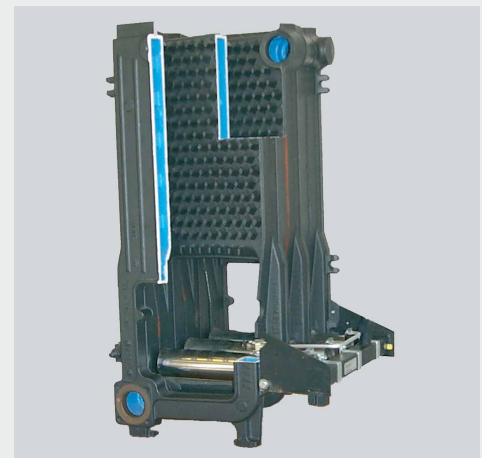
Wet-base sectional design for longer service life

Weight includes insulation, burners and packaging.