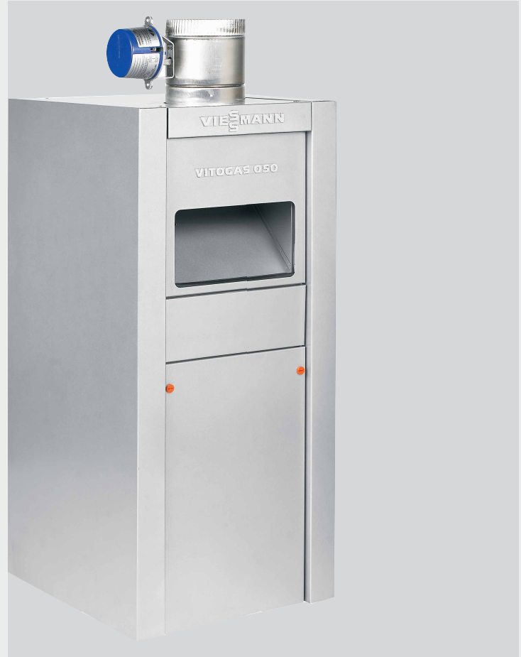
Vitogas 050, ECD-S: economical, compact and reliable