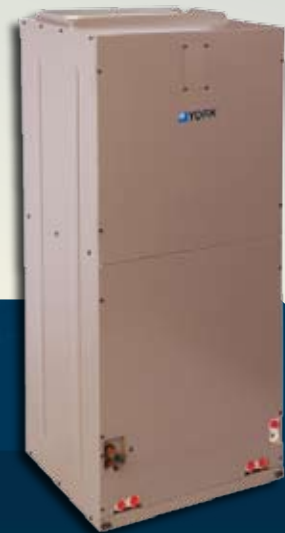
Single Piece Air Handlers [AHP] with evaporator