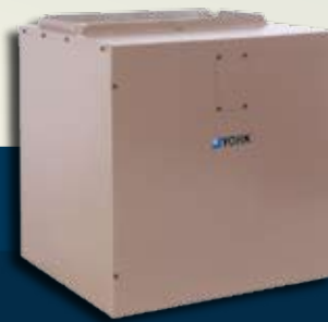
Modular Air Handlers [MV]