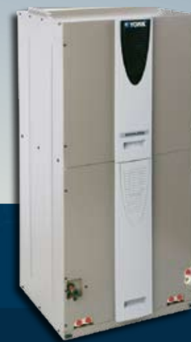
Single Piece Air Handlers [AVY] with evaporator