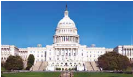
United States Capitol, Washington

Since 1874, we've provided air quality solutions for some of the most complex structures in the world. And for over 40 years, York is the chosen brand by Canadian consumers when it comes to ensuring year-round comfort for their loved ones. And because York units are designed and built in North America, you can be confident that your system will provide your family with comfort, energy savings and lasting performance.