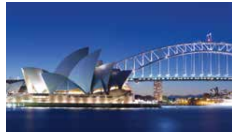
Opera House, Sydney