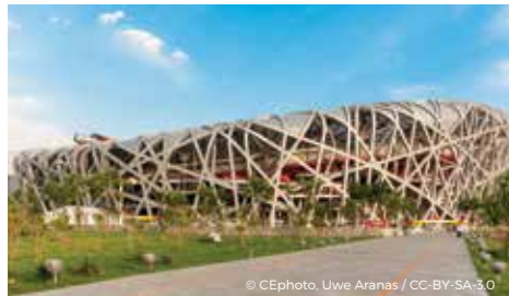
National Stadium, Beijing