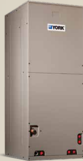
Single piece air handler (AHE-AHV) with evaporator